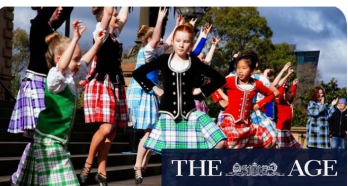
Music and a wee bit of sunshine make for a bonnie Tartan Festival