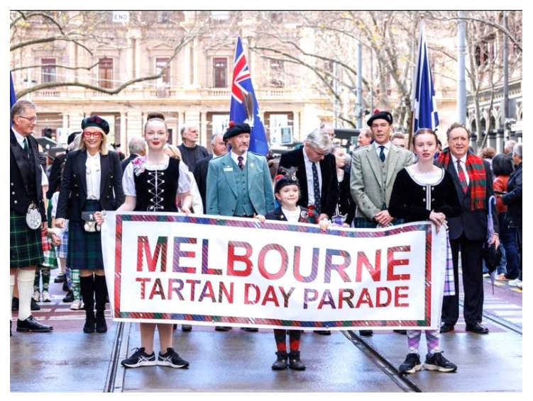
The Melbourne Tartan Day Parade down Collins Street

A Scottish Gaelic Class was presented by the Scottish Gaelic Society of Victoria at The Assembly Hall Melbourne on Saturday 8<sup>th</sup> July. The Scottish Gaelic Society of Victoria boasts a long history, having been founded in 1904. Attendees at the afternoon event were introduced to the basics of Scottish Gaelic language, music, and culture.