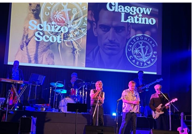
The Theatre Royal, Castlemaine