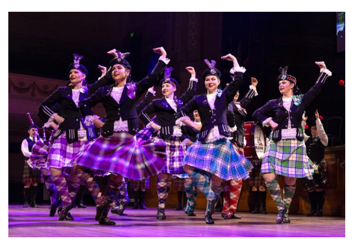
The Glenbrae Celtic dancers