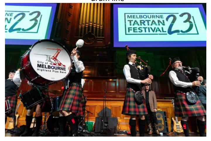
The City of Melbourne Highland Pipe Band