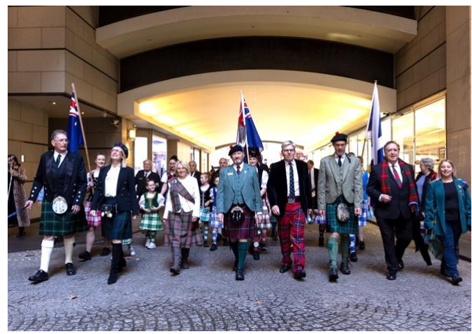
The Parade entering the Westin Hotel forecourt