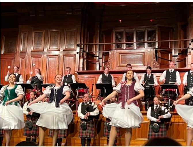
City of Melbourne Highland Pipe Band