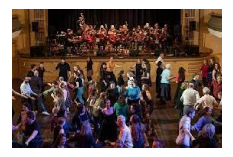
Ceilidh at the Collingwod Town Hall