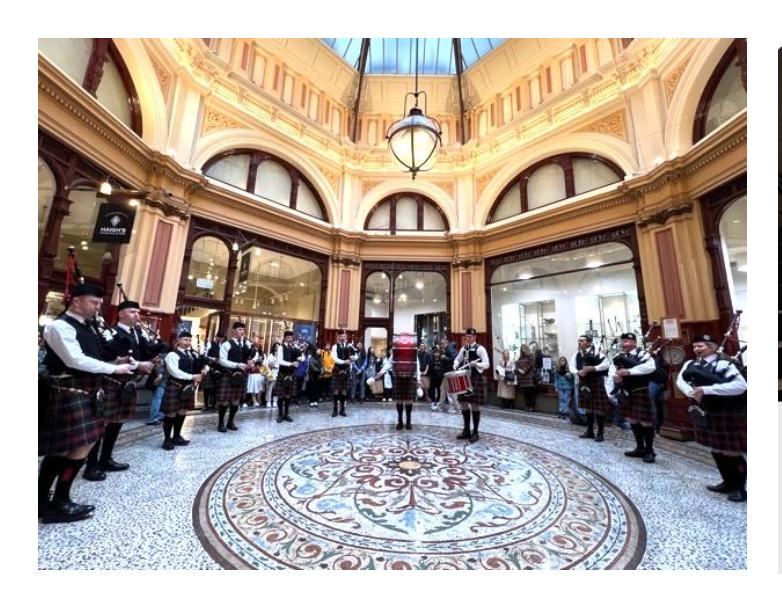
Pop-up piping performance at The Block Arcade

A special pop-up performance at The Block Arcade added an unexpected twist, surprising and delighting City shoppers.