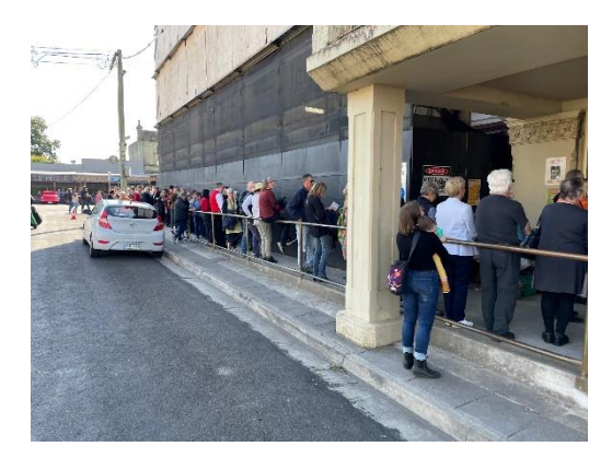
The overflow fans queue up at the Creswick Town Hall