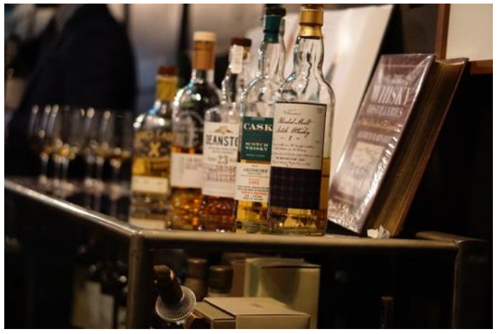
Rare and old whiskey tasting event at Whiskey & Alement

The festival further immersed attendees in Scottish culture through diverse events such as the two 'Sounds of Scotland' concerts by The Scots School Albury Pipe Band, an enlightening online lecture series titled 'A Grand Tour of Scotland parts 1 and 2', a CBD 'Scottish Connections' guided walking tour and 'The Scots Cellar: Rare and Old Whisky' featuring a unique tasting of rare and aged whiskies. The audience enthusiastically applauded up and coming young fiddle band 'Out of Hand' who enthralled all with their musical talent at such a young age. Warmly greeted for their performance at the concert was the trio of neurodiverse teens from 'Keys of Life'. Singer of traditional Scots song,