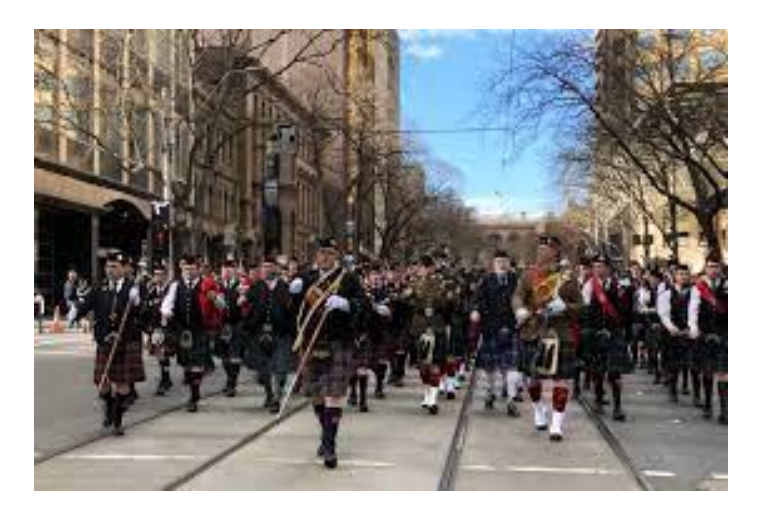
The Melbourne Tartan Day Parade Massed Pipe Band

The parade was complemented by pop-up events at Gordon Reserve, Burns Poetry Readings at Robert Burns Statue, Highland Dance exhibitions on terrace of The Old Treasury Building and Pipers on The Balconies of The Old Treasury Building, adding to the festive atmosphere.